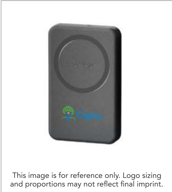
This image is for reference only. Logo sizing and proportions may not reflect final imprint.